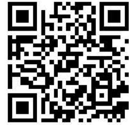
Connect to care today

This referral service is available 24/7/365, no matter what health insurance you have they can connect you to care in a timely manner.