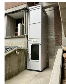
Exterior view of the ADA Lift at the Parker School

Community Education Bathroom Renovations: The Community Education Bathroom Renovations project is a FY22 Capital Improvements Project. The project was awarded to a contractor in the amount of $549,000 in August 2022. The scope of work includes renovations to all the adult and children bathrooms in the Community Education Building and including necessary ADA upgrades. The project is still very much a work in progress, as pictured below, but is anticipated to be completed this spring.