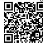
Narcan Training All Sessions