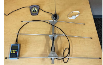
An antenna and tracking device used by Chelmsford Police as part of the SafetyNet program.

The program and bracelet are free for Chelmsford residents.