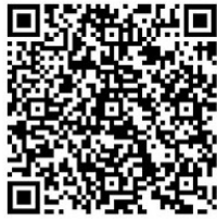
Hoarding Disorder 2/22/2023