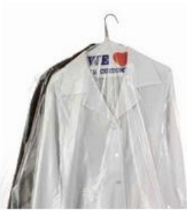
DRY CLEANING BAGS