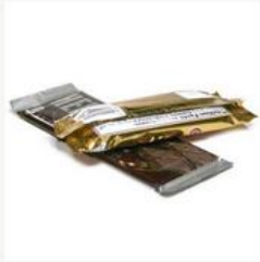
CANDY BAR WRAPPERS