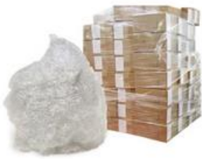
PALLET WRAP AND STRETCH FILM

All plastic must be clean, dry and free of food residue.