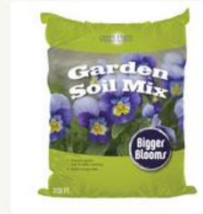
MULCH OR SOIL BAGS