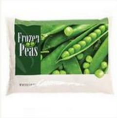
FROZEN FOOD BAGS