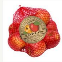
NET OR MESH PRODUCE BAGS