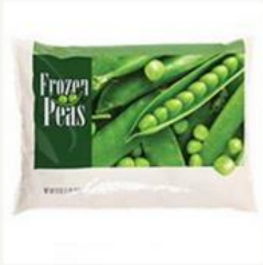
FROZEN FOOD BAGS