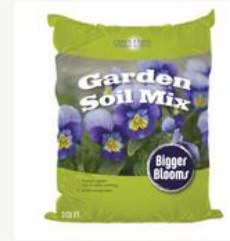
MULCH OR SOIL BAGS