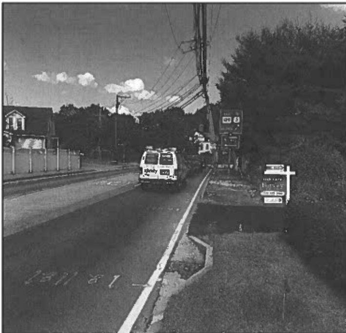
No sidewalk along south side of Billerica Road eastbound approach