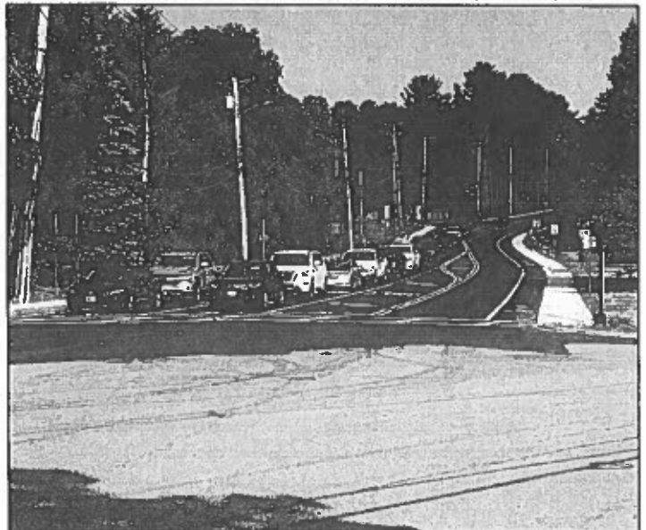
Queueing along Billerica Road westbound approach – June 2022 evening peak hour